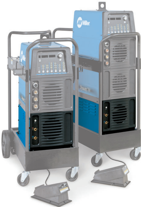
Coolmate 3.5 shown with Dynasty® 400 TIGRunner® and 700 TIGRunner®