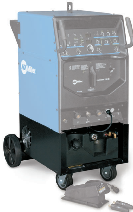
Coolmate 3X shown with Syncrowave® 250 DX TIGRunner®