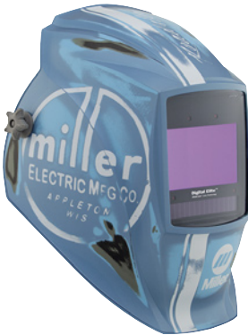
Vintage Roadster™ 281004