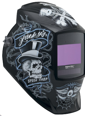
Lucky's Speed Shop™ 281001