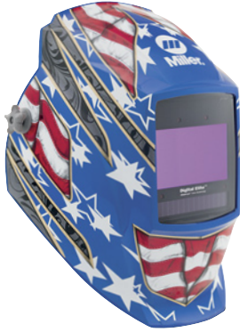
Stars and Stripes™ III 281002

©2020 Caterpillar. CAT, CATERPILLAR and their design marks are registered trademarks of Caterpillar, Miller Electric Mfg. LLC is a licensee of Caterpillar Inc.